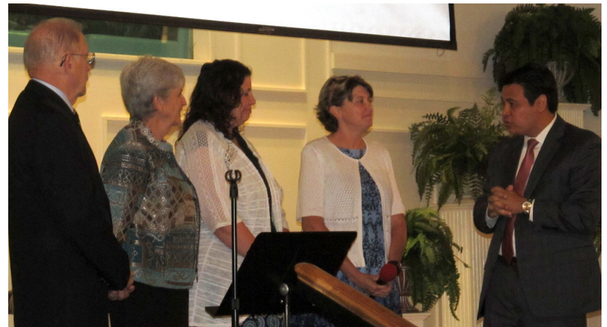
Teacher Dedication on Sabbath, August 12, 2017